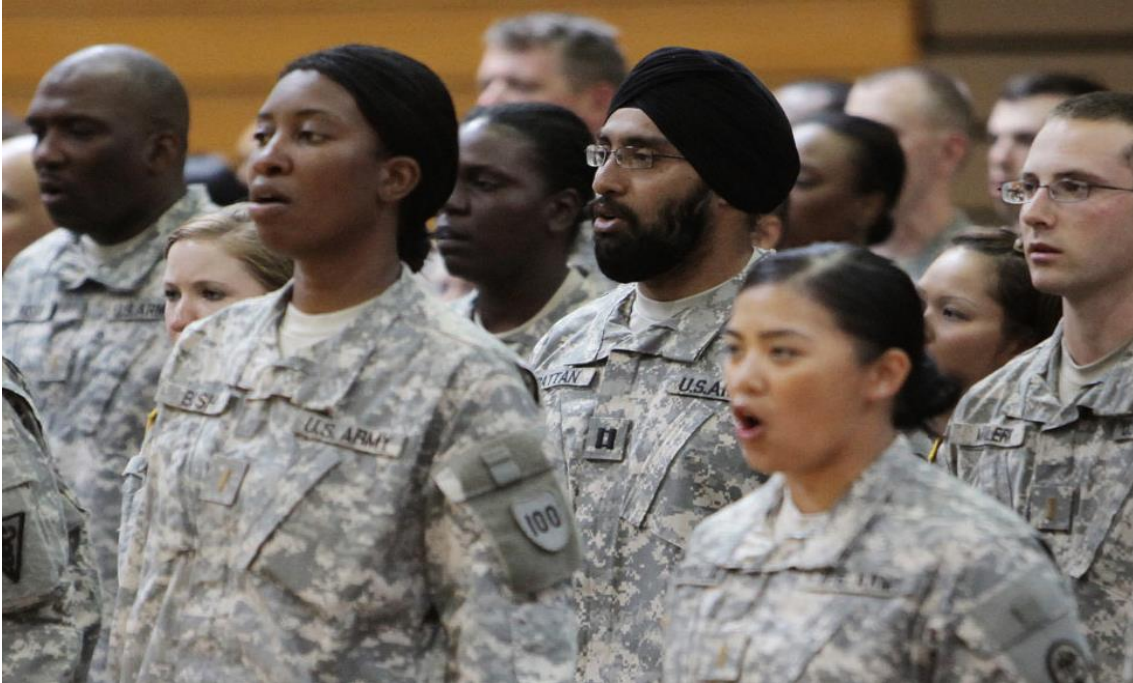
American Sikh Soldiers An integral part of the US Defense Force