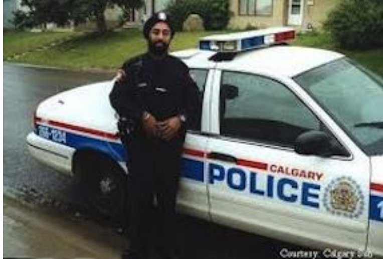
A Canadian Sikh Police Officer On Duty