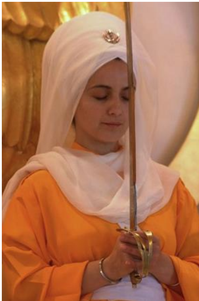
(A Sikh Woman in Prayer)

The Sikh Guru Sahibs worked to change the religious and societal customs of the time. They empowered women by giving them a wider variety of social responsibilities. They invited women to join in the Sikh Congregations as equal partners, to actively participate in all religious, cultural, and social activities of the Gurdwaras (Sikh Houses of Prayer). Within the Gurdwaras, they made women in charge of the Langar (Guru's Free Kitchen).