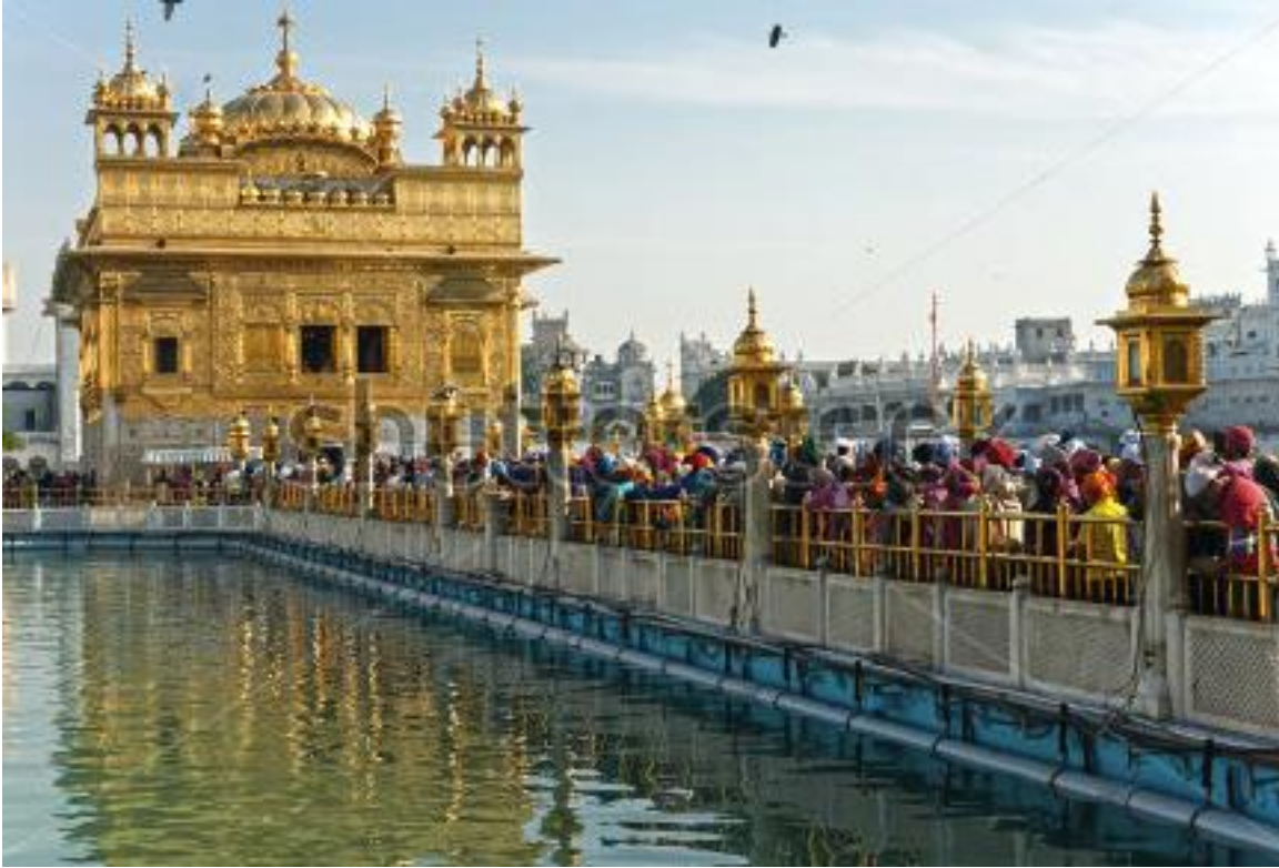
The Darbar Sahib - Golden Gurdwara Sahib A Symbol of Total Equality and Unity in Action