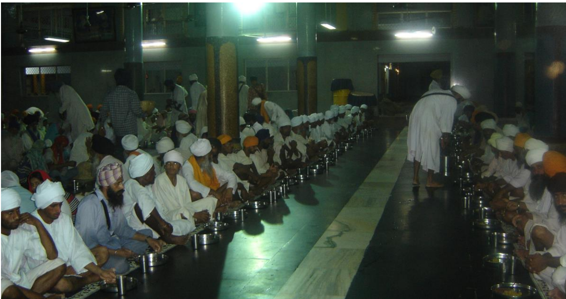
A glimpse of ...the Guru's Free Kitchen, Langar,