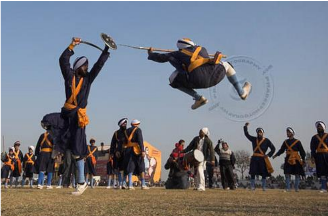
GATKAA – The Sikh Martial Art