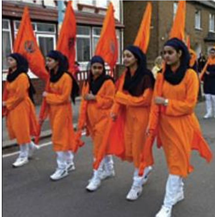
(Sikh Women ... on the move)

During the times of the Sikh Gurus, vast majority of the prevalent religious beliefs promoted the subjugation of women. For example, some faiths declared that 'a woman does not have a right to speak in any religious gathering'. Others mandated that the word of TWO women in a court of law to be the equivalent of ONE man's testimony.