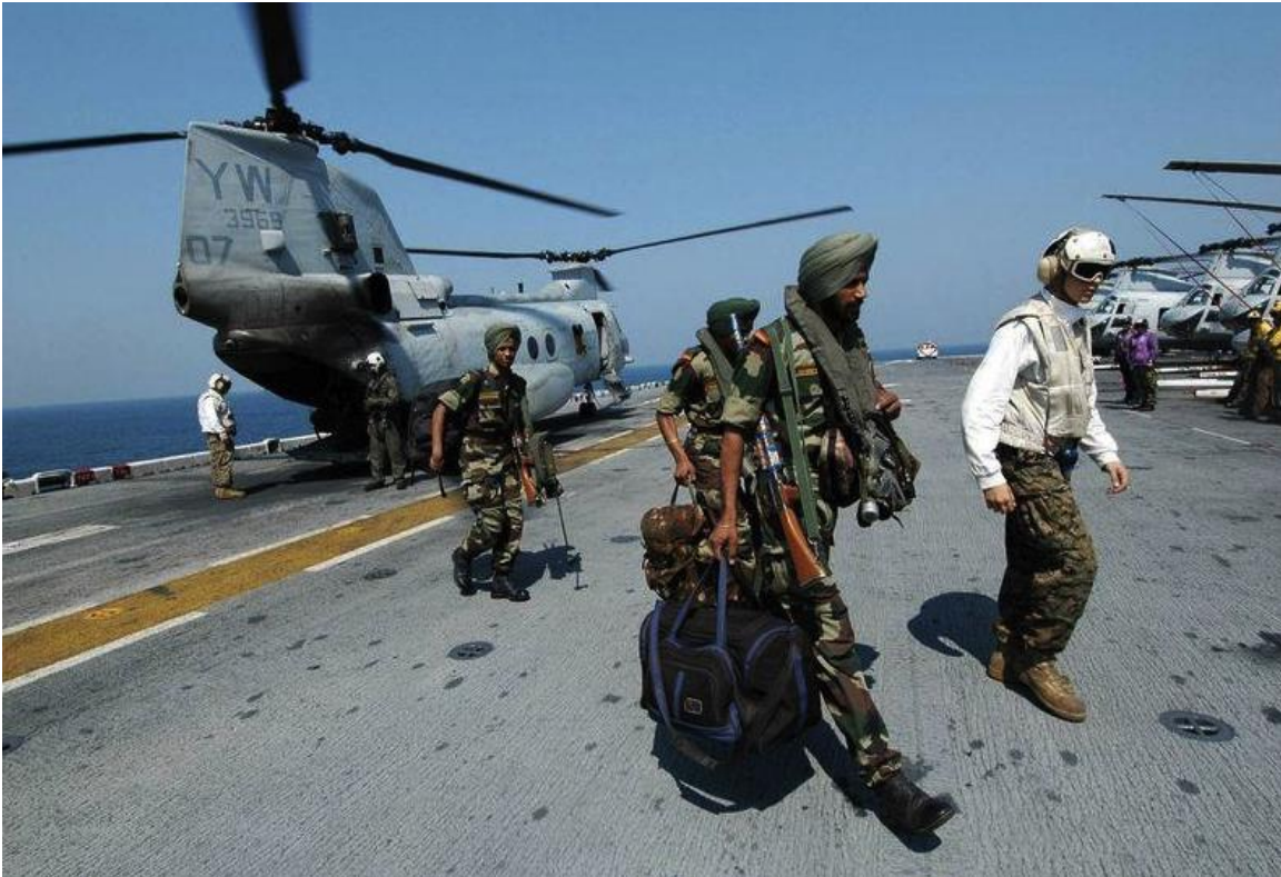
Sikh Soldiers in Service of Humanity